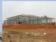
1144 Harbourtown by Buildtec